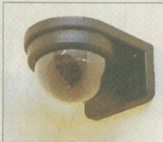
■ EYE, EYE: One of the webcams